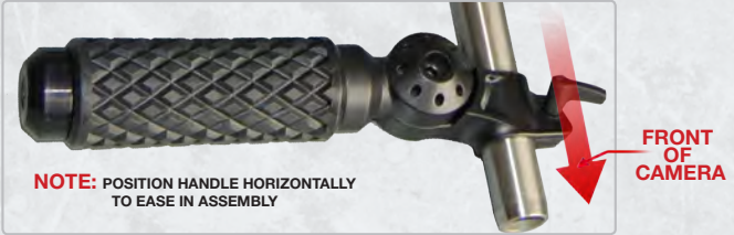
RIGHT HANDLE INSTALLED