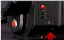
SD MEMORY LOCATION