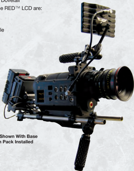
RED ONE™ Shown With Base Production Pack Installed

Additional accessories are available for purchase to create the perfect camera to fit your exact needs. Log on to www.red.com/store .