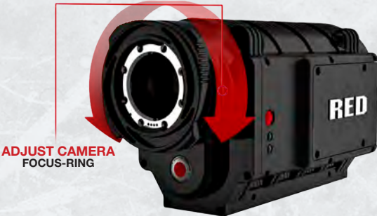
ADJUST CAMERA FOCUS-RING

NOTE: The digital zoom function of the camera can aid with visibility, and may help achieve more accurate results.